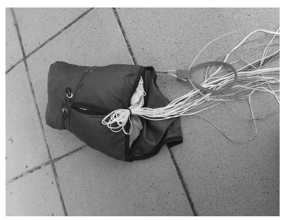
Picture 3 shows that the length of the connecting line bring the heavily structured handle into the area of the released suspension lines before the reserve parachute is released.