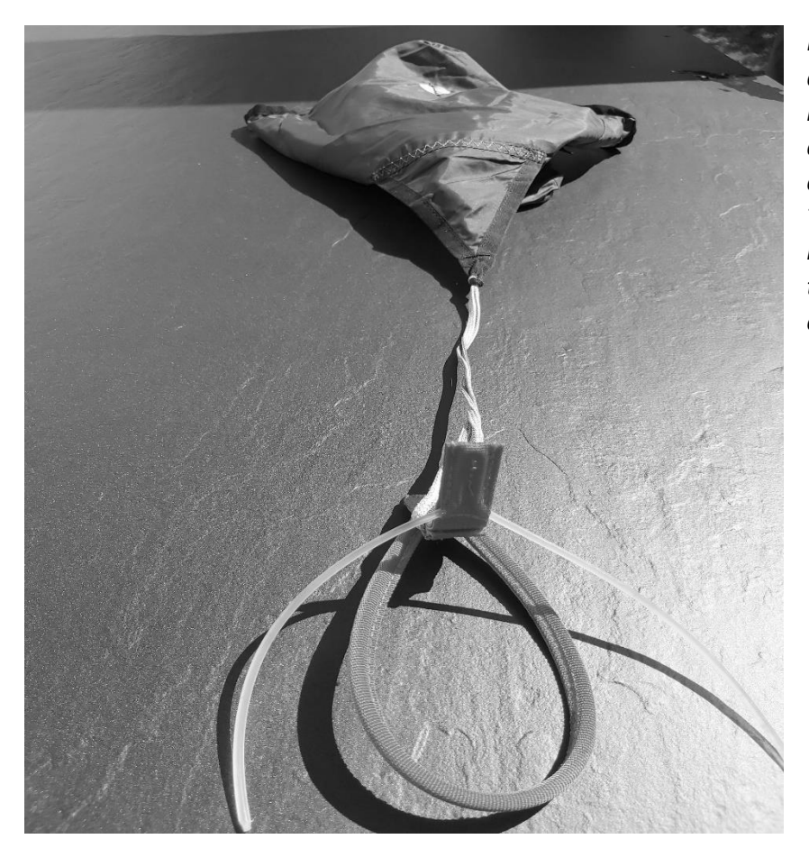
Picture 2 shows the deployment handle of the harness and the long connecting line to the inner container of the rescuer. The connection is also lengthened by the triangular cloth on the inner container.