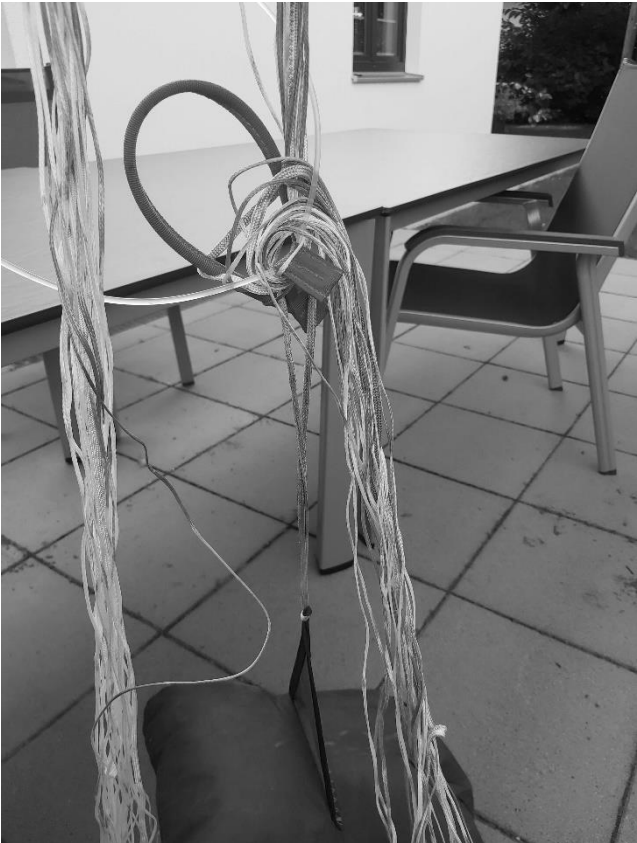
Picture 5 shows that the heavily structured release handle can cause a strong tangling / twisting with the reserve parachute 's suspension lines relatively easily and reproducibly (simulated).

Picture 4 shows the strong and firm entanglement of the handle with the suspension lines of the reserve parachute. The accident equipment arrived at the DHV for investigation in this condition.